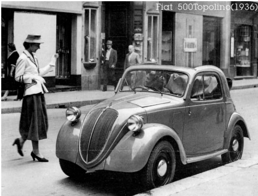
Fiat 500 Topolino (1936)

Early Fiat 500 - predecessor to the Bambina that started our Club in 1964, still a style icon with the new 500 recently launched.