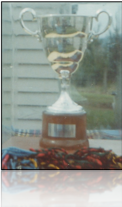
TORINO MOTORS TROPHY: This trophy used to be competed for annually between the Fiat Club Waikato, FOCNZ and the Auckland Fiat Lancia Club.

It's that time of the year again when you need to return any trophy you may have collected at the AGM in February 2008 so that it can be engraved before the next AGM.